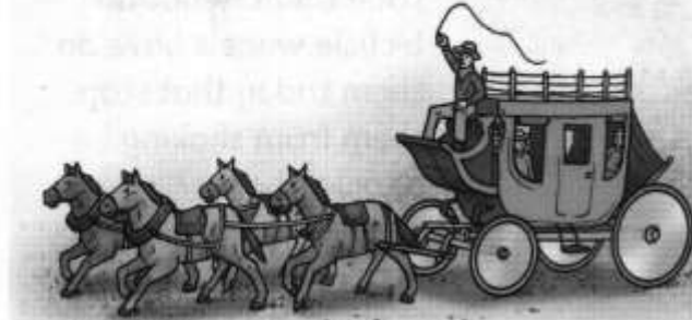
A coach used to transport people

Carts and wagons were used to carry goods and people. These forms of transport are still used in parts of the world today.