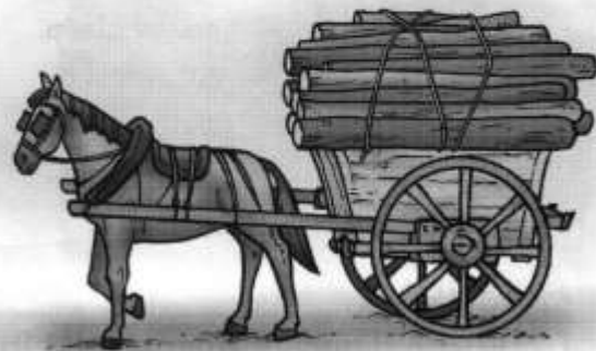
A cart carrying a load of wood