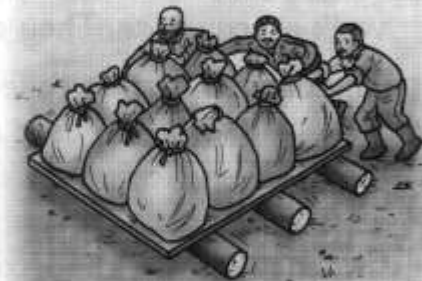
Logs being used to move heavy objects

The invention of the wheel was so useful that the idea spread and changed people's lives all over the world. The first form of transport to use wheels was the cart.