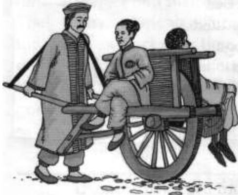
In China, the wheel was used in the earliest cart in about AD 300.

Carts have two wheels and are pulled by horses or donkeys. They are used for carrying light loads.