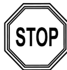
Stop street ahead