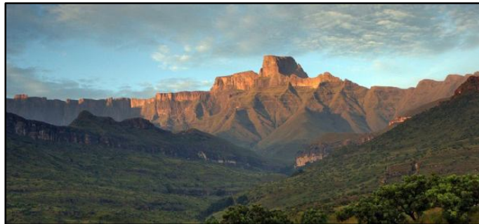
The uKhahlamba – Drakensberg Mountains

To more water there is in a river, the more energy a river has, to make the valley bigger. As the river flows towards the sea, it will join with other rivers and become larger. Higher up in the mountains, the river has less water, so the valleys are smaller. Lower down, the river has more water and the valley is wider.